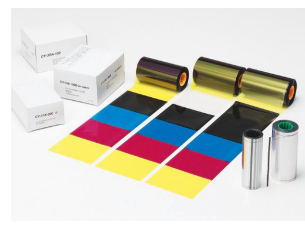
Ink Ribbon & Retransfer Film

*CX-D80 series is prohibited to export/re-export to Cuba, Iran, North Korea, Sudan and Syria by Export Administration Regulations of USA.