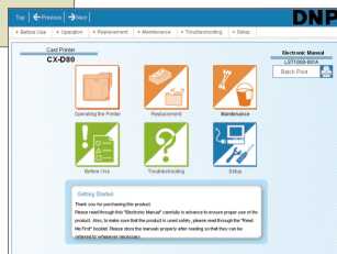
CX-D80 Electronic Manual (in CD-ROM)